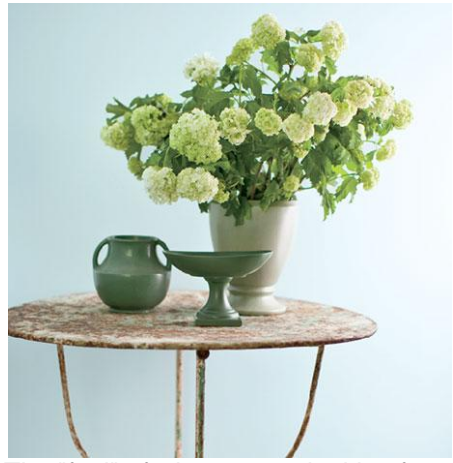
The "feel" of what we are looking for